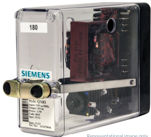
Representational image only