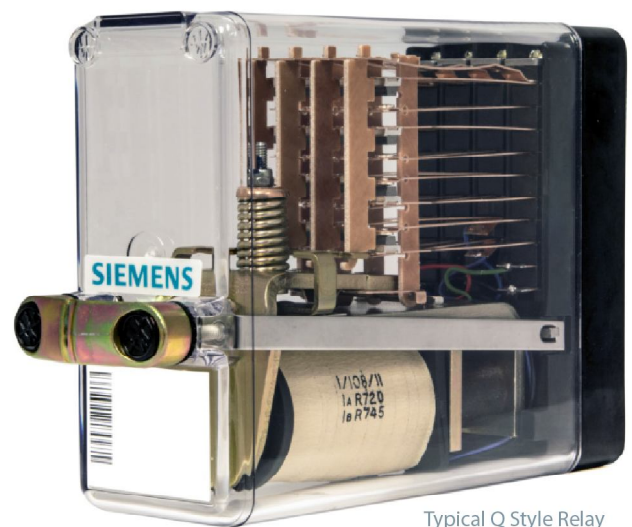
Typical Q Style Relay