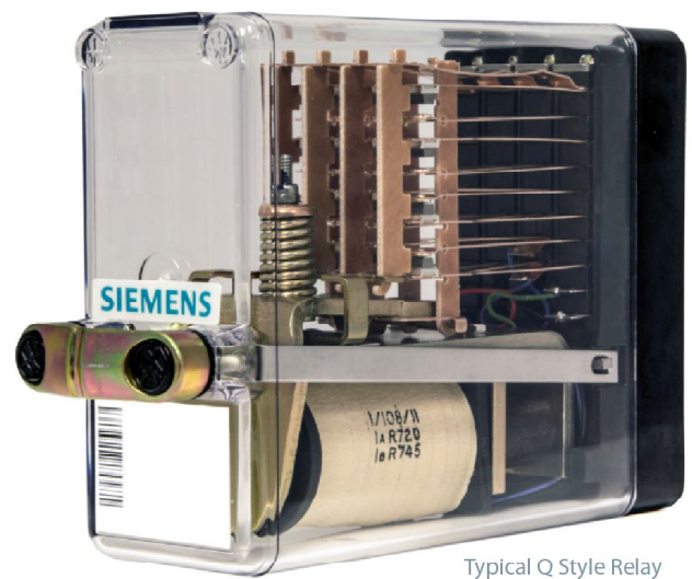
Typical Q Style Relay