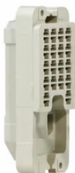
Un-drilled plugboard Part No. E7218/1