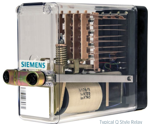
Typical Q Style Relay