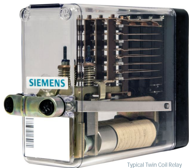
Typical Twin Coil Relay