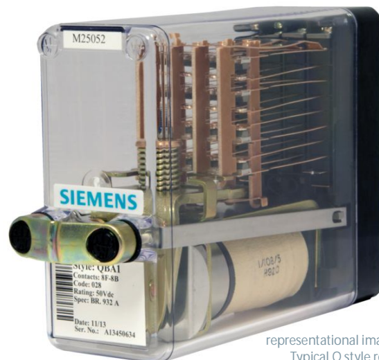
representational image only Typical Q style relay