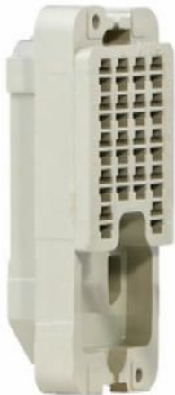
Un-drilled plugboard Part No. E7218/1