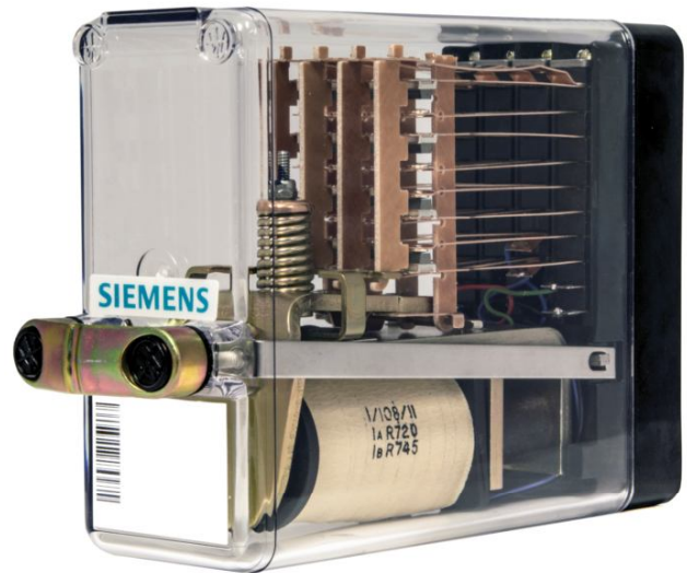
Typical Single Coil Relay