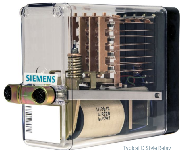
Typical Q Style Relay