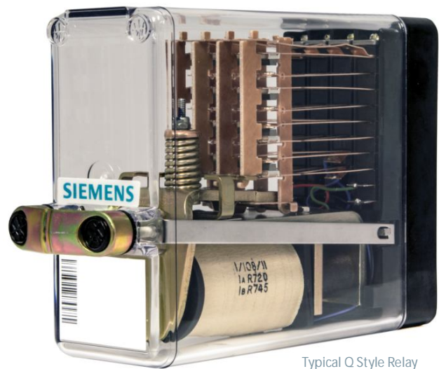
Typical Q Style Relay